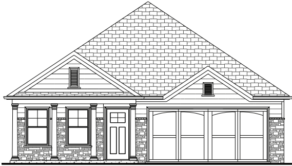
THE ASHTON HEATED - 1753 SF

Homesite 27 203 Sandy Creek Cove Acworth, GA 30102