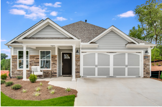
THE KELLY HEATED - 1301 SF